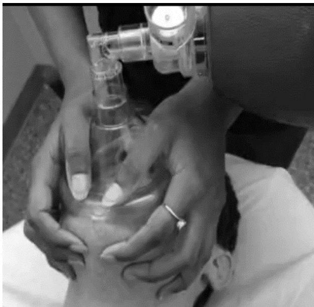
TWO-HAND MASK SEAL