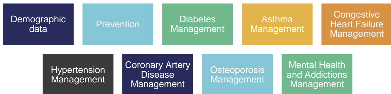
Figure 2: Primary Care Data Extract files

Clinics are encouraged to review the full table of data elements and understand where and how the information is captured in their EMRs. This will provide clinics with the best opportunity to submit comprehensive information through their PCDE submissions. The list of data elements can be found in Section 3 of the Primary Care Quality Reminders and Data Extract Specification .